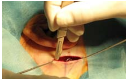
Figure 2. Tenting the skin to facilitate soft tissue reduction.