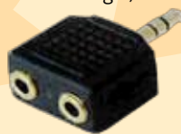
3.5mm stereo splitter